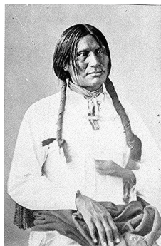
Chief Big Foot

In order to restore faith in the traditional way of life, the Lakota began to perform the Ghost Dance in the 1890's. The Lakota believed that performing the Ghost Dance could