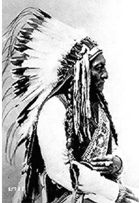
Chief Sitting Bull

The catalyst for the event was the murder of Chief Sitting Bull, who was killed by tribal police who were trying to arrest him on December 15, 1890. After the murder, 350 Lakota fled the area but were pursued through freezing cold conditions, rounded up, and held at Wounded Knee Creek where they were to be disarmed.