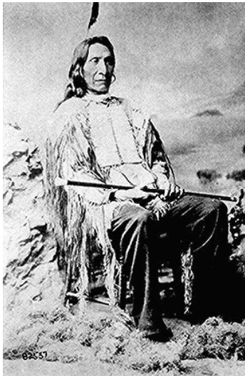
Chief Red Cloud

In 1868, the United States government signed the Treaty of Fort Laramie with Chief Red Cloud, which granted the Lakotas exclusive occupation of a huge tract of land in and around the Black Hills, the most sacred of places to the Lakota. The terms agreed to by both parties was "for the absolute and undisturbed use and occupancy of the Sioux" and prevented wasichus (white people) from settling on or even entering the territory outlined by the treaty.